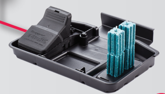
Protector EVQ EXPRESS iQ

Instead of time spent checking rodent devices with no activity, pest control experts can spend their time solving problems.