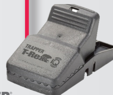
Protector EVQ TRAPPER T-Rex iQ