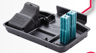
Protector EVQ EXPRESS iQ