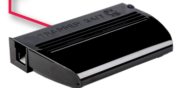
Protector EVQ TRAPPER 24/7 iQ