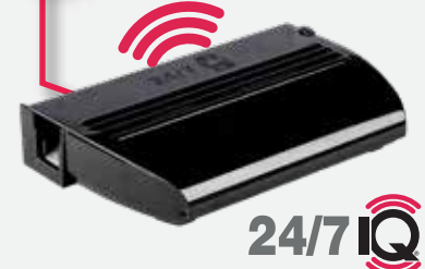
24/7 ® iQ ®