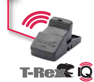
T-Rex ® iQ ®

Instead of wasting time checking rodent devices with no activity, pest control experts can spend their time solving problems.