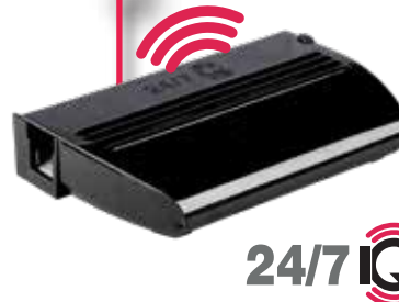
24/7 ® iQ ®